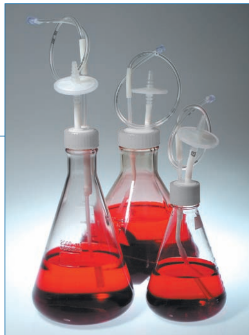
Bio-Simplex Erlenmeyer Flask Systems feature the Closure Assembly, flask and cap.

Customer-generated designs, sizes, packaging and other options — such as connectors, heat-sealed ends or alternate materials — are available as custom orders.