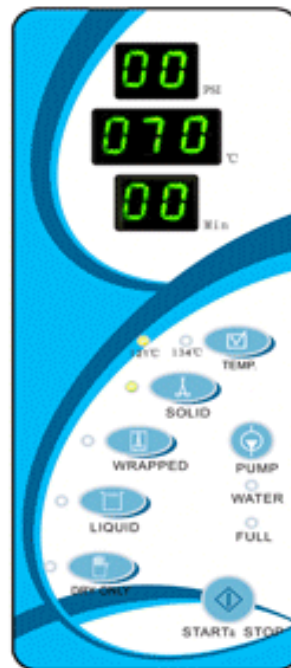
Control Panel (BioClave 16)