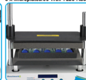
9 x 50ml Horizontal QuEChERS Method