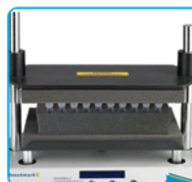
50 x 1.5/2.0ml