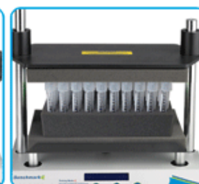
50 x 5,7 or 10ml