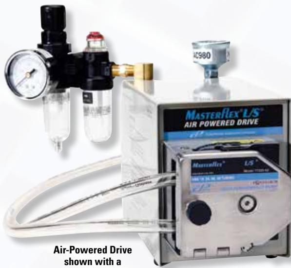
Air-Powered Drive shown with a High-Performance pump head